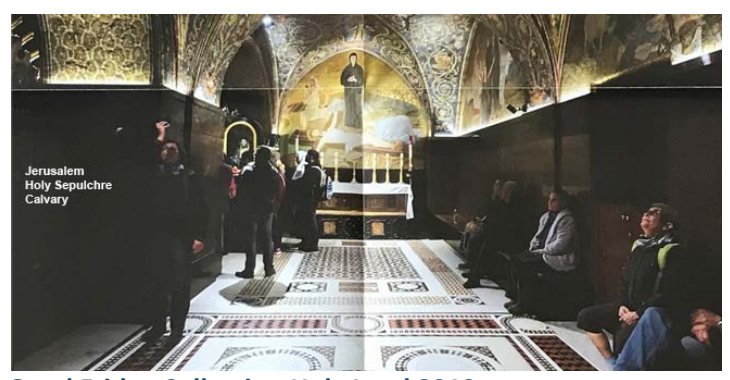
Good Friday Collection Holy Land 2019

Every year the CAs of the world – especially young people – are committed to promoting the Collect on Holy Friday by collaborating with everyone at the diocesan and parish level. more